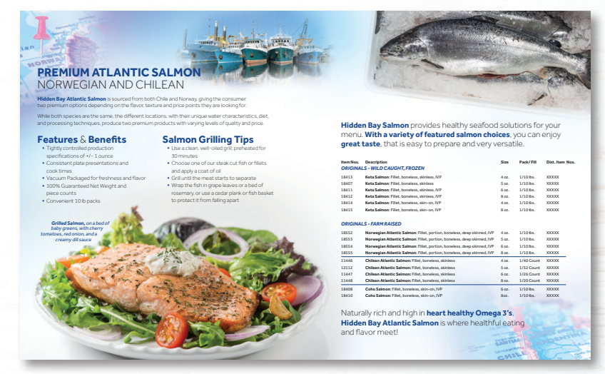
Steak Cut Fish POS (Spread)