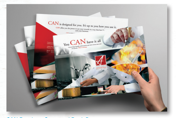
CAN Brochure Cover and Back Page