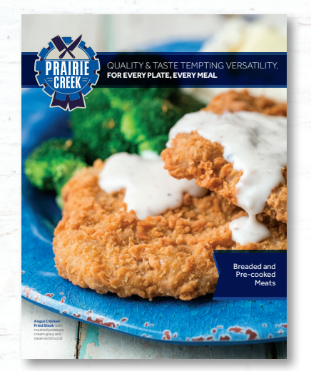
Breaded & Pre-cooked Meats POS