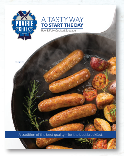
Raw & Fully-cooked Sausage POS