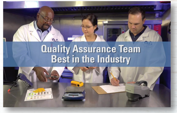
IMA QA Video Series