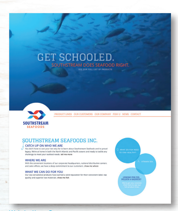
Website Home Page