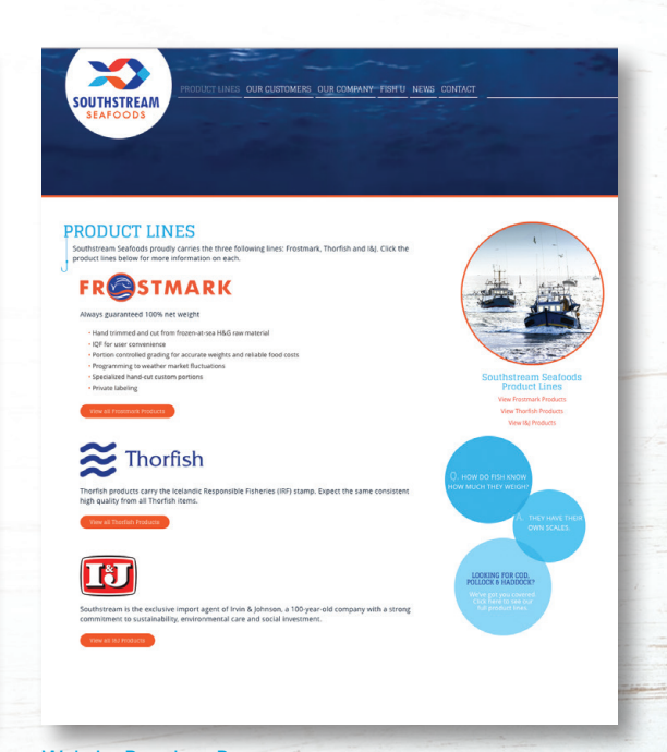
Website Daughter Page