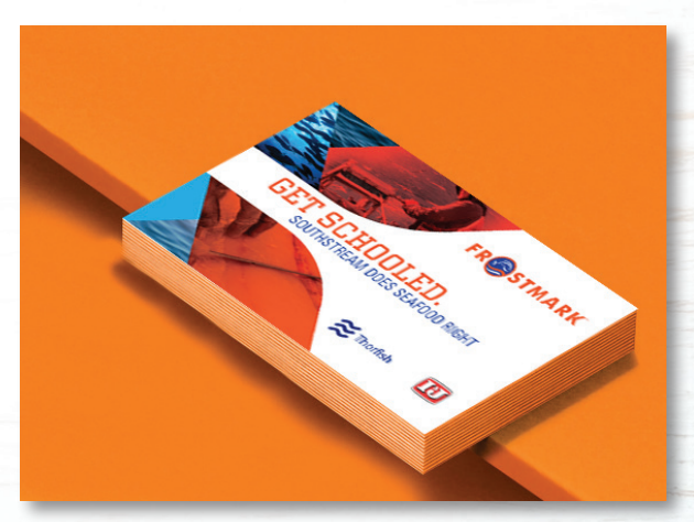
Business Card Back