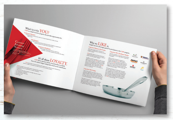
CAN Brochure Spread