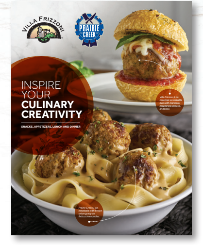
Pre-cooked Meatball POS